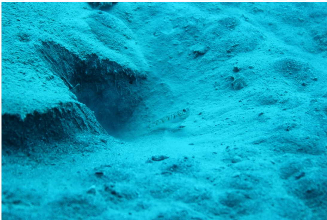
Figure 2. A general view of Vanderhorstia mertensi in front of its nest (Photo: Ali Türker).